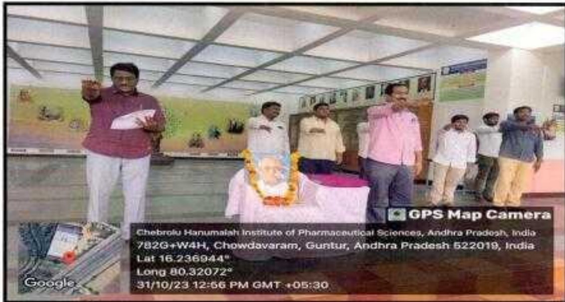
Pledge on the occasion of National Unity