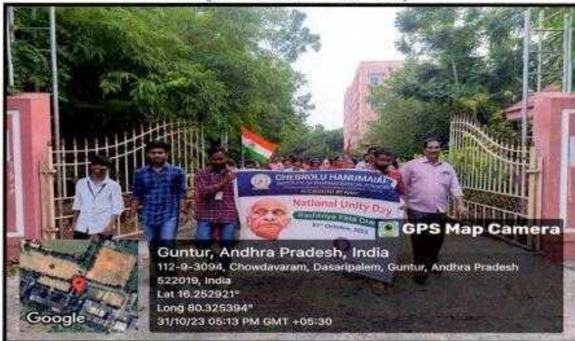
2K walk on the occasion of National Unity