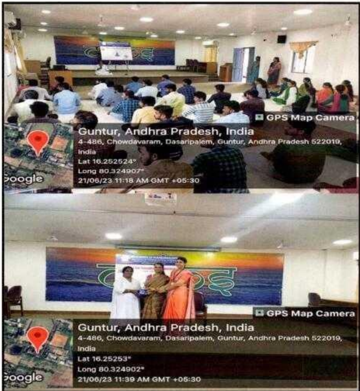
Yoga practice session for students and felicitation of guest