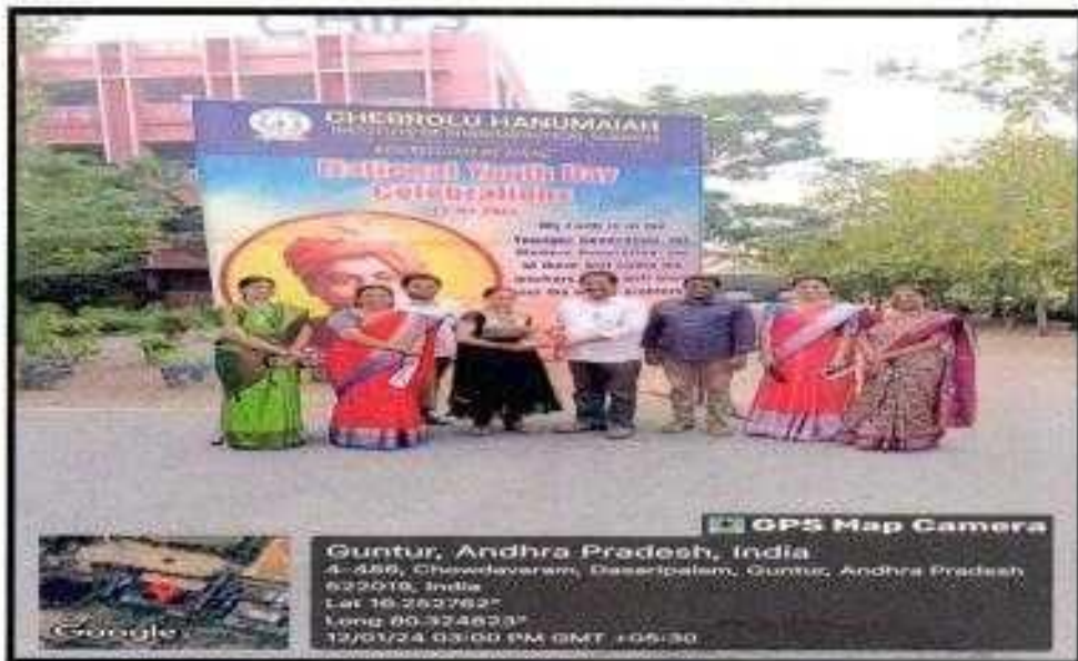
Prize distribution for winners of National youth Day