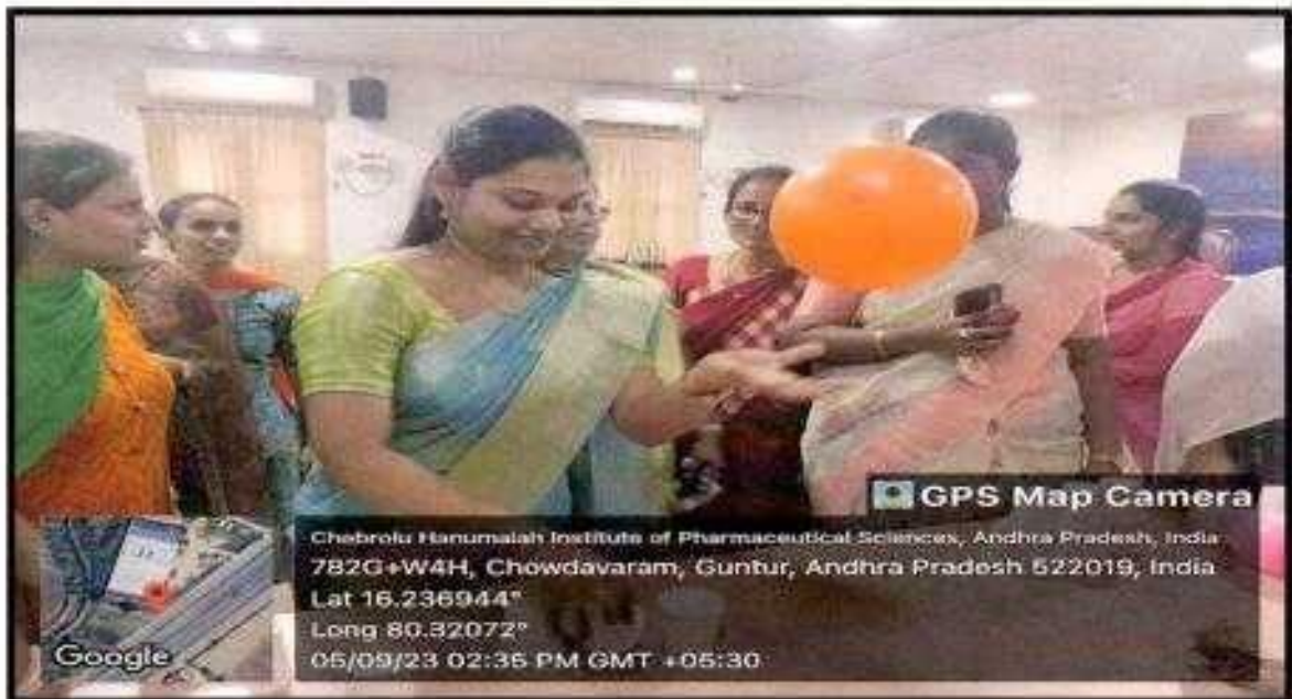
Staff at teachers Day celebrations