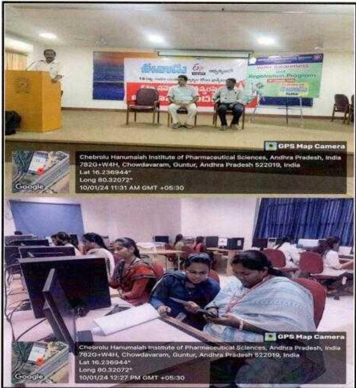
Voter Awareness & Enrollment Program