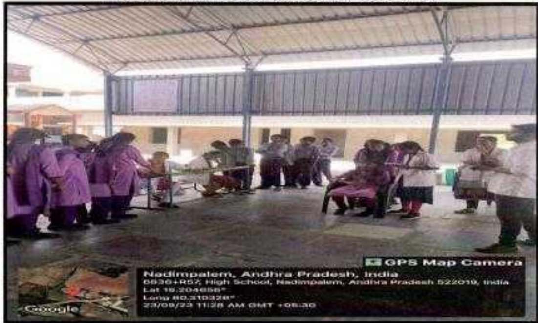
Eye vision testing at Z P School, Kondrupadu on the eve NSS DAY