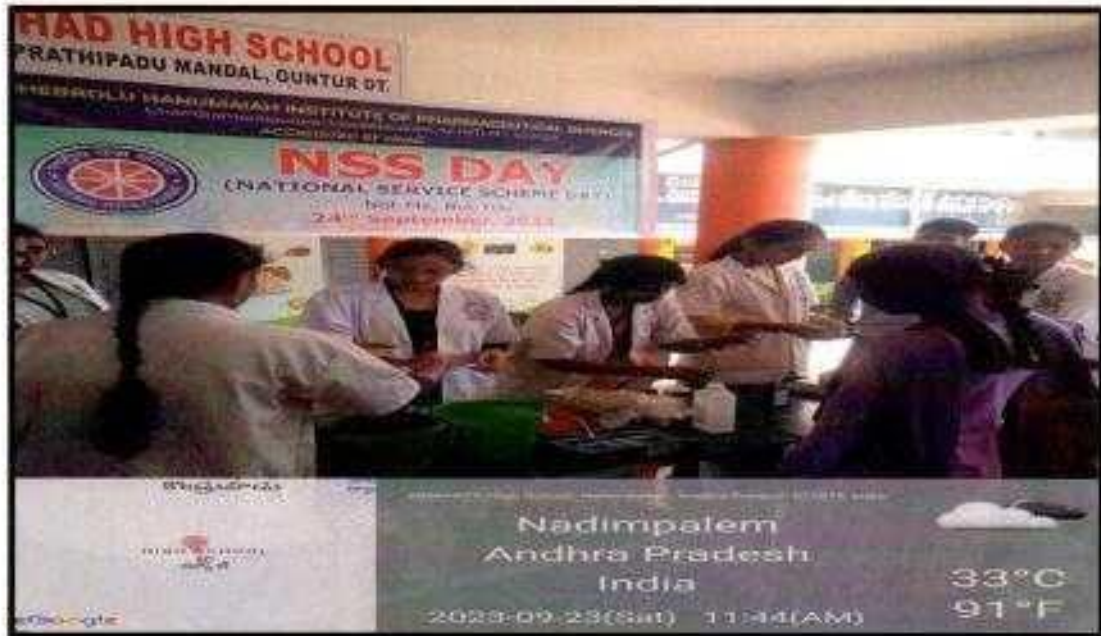
Hb testing camp at Z P School, Kondrupadu on the eve NSS DAY