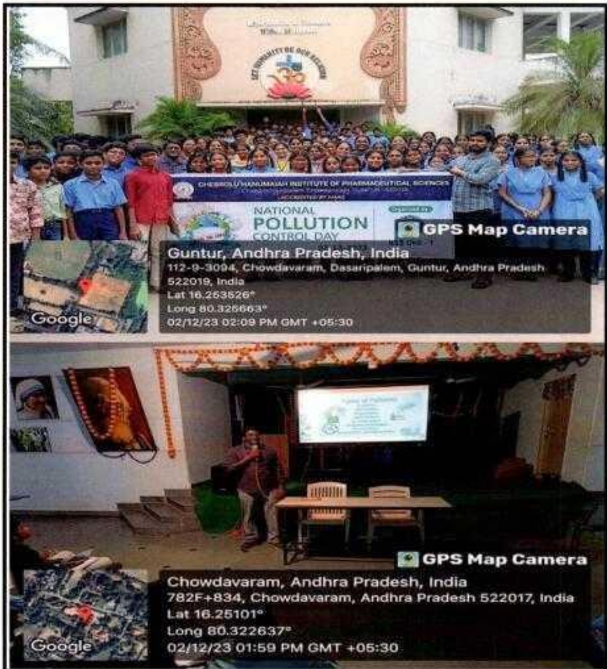
Awareness programme for school students about National Pollution Control Day