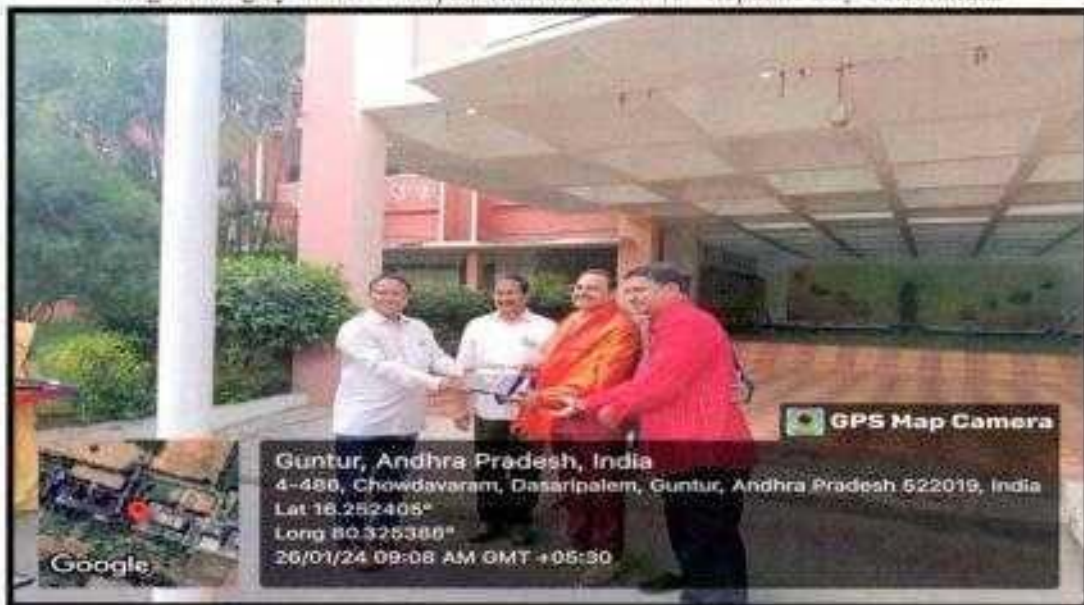
Felicitation of chief guest on the occasion of 75 th Republic Day Celebrations