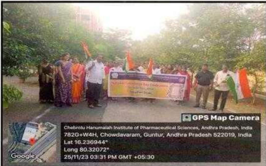
Constitutional pledge and walk on the eve of National Constitutional Day