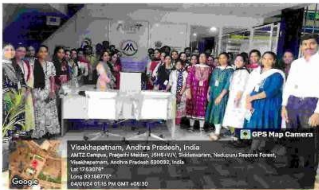
Students at PYRAMED Division of AMTZ