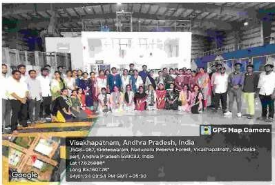
Students with Staff at AMTZ

Post successful completion of the field visit, the staff and students have thanked the in-charges of Andhra Pradesh Medtech Zone Limited (AMTZ) for their timely and valuable assistance in field visit.