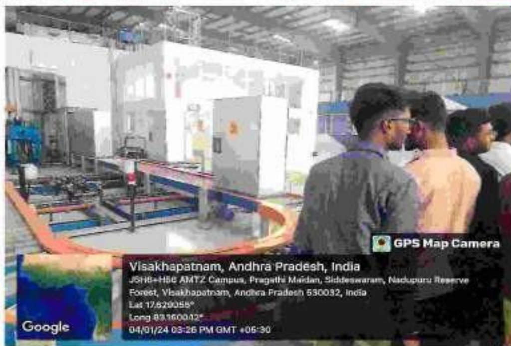
Students at COBALTA Division of AMTZ