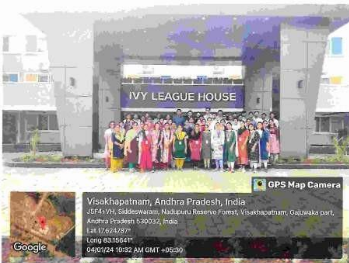
Staff and Students of CHIPS at Ivy league House of AMTZ