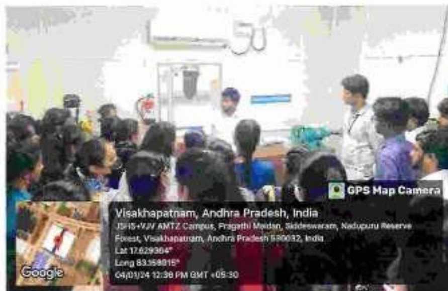
Students at ADDIT: 3D Prototyping Facility at AMTZ

The students and staff were taken to ADDIT: Centre for medtech innovation and rapid prototyping facility at AMTZ. At ADDIT, the students got the information on how artificial limbs were developed, integrated and supplied to people in need. In this area, 3D assisted printing technology was learnt.