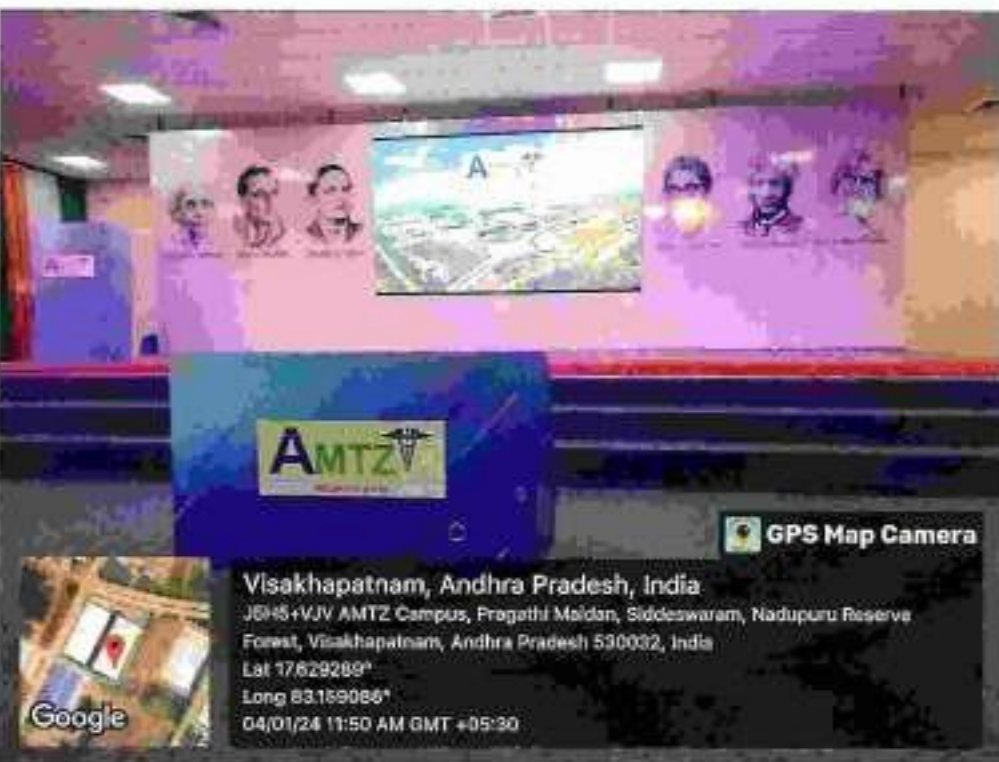
Students Visiting the Achievements by AMTZ